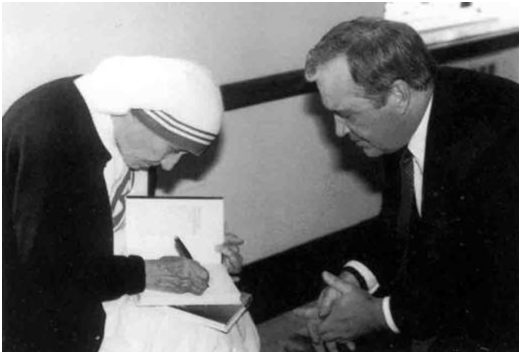
Mother Teresa with author.